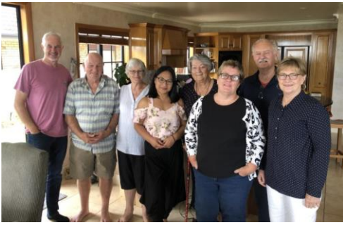
The small Bible Study Group