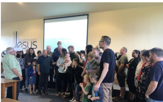
The congregation praying over the babies and their family.