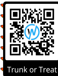
Trunk or Treat

If you would like to donate candy and/or mini sodas, we have baskets in the main foyer on the side tables for your convenience. Also, if you'd like to sign up for a trunk and/or game, use this QR code to see what's available.