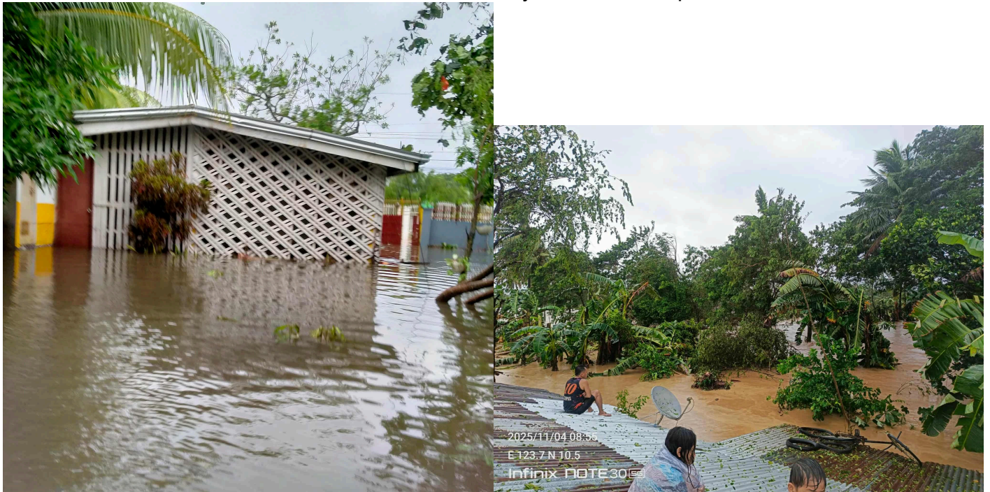
The Church Building in Balamban (top/left photo) and the house of Gina's relative (bottom/right photo) was almost submerge during the typhoon.

Just as we were recovering from the earthquake, Typhoon Tino struck the central Philippines, bringing widespread flooding and destruction. In Cebu City, Balamban, and many of the surrounding areas, floodwaters rose rapidly. Some areas saw water reach the height of first-floor roofs. Several families had to evacuate or seek safety on their rooftops.