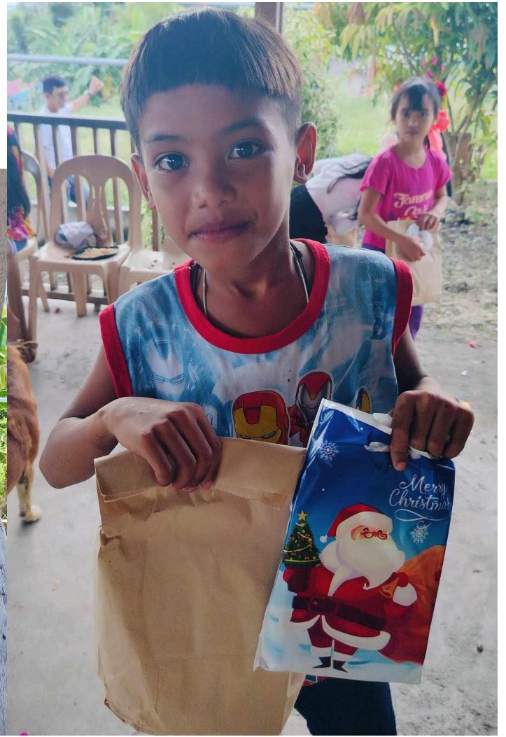
Mountain Top Ministry Year-end Party (Kids and Church)